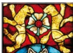
The Luther Rose in the Lion and Parrot window of the church

Silent prayers in the Meditation Room in the Woad House (except on public holidays and during the local summer holidays).