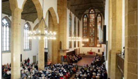
St Augustine's Church

On Sundays and church festivals we celebrate Holy Communion at 9:30 in the morning. Following the service, we invite you to join us for church coffee or tea.