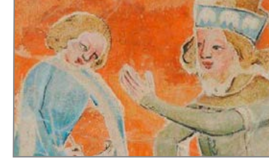
Part of the mural in St Elisabeth's chapel