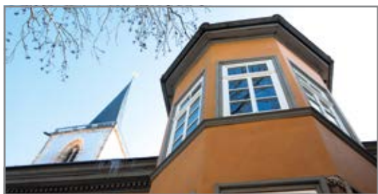
Exterior view from the street

Our hotel on the banks of the river Gera in the old city quarter offers you stylish and lovingly furnished surroundings where you can find peace and comfort. The hotel is about 100 metres/yards from the monastery.