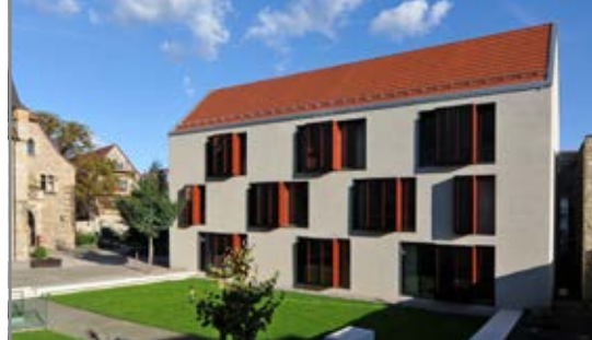
The Woad House at St Augustine's