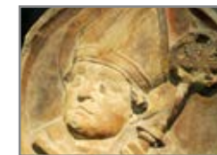
St Augustine of Hippo (key stone)