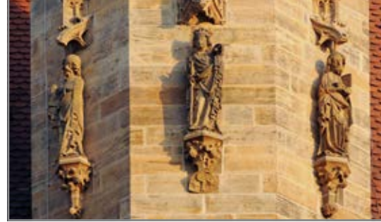
Statues on the tower of St Augustine's church, restoration financially supported by the Circle of Friends

TAGEN & BEGEGNEN evangelisch gastfreundlich