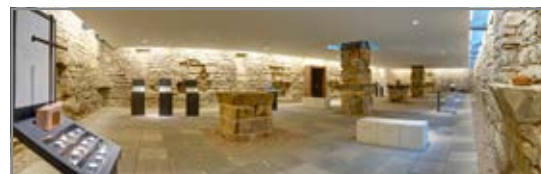
Place of Tranquillity

We invite you to pray with us every day. Midday prayers take place at 12:00 and evening prayers at 18:00. On Tuesday evenings during the summer months, we pray in St Elisabeth's chapel in the Nikolai tower, which is opposite the Nikolai hotel and just a short walk from St Augustine's. Every Thursday evening prayers are in English.