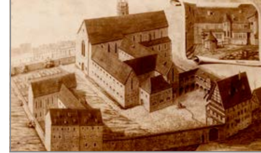
View of the monastery buildings sometime after 1669

Please let us know in advance if you would like to visit. Tours for groups are possible with prior registration.