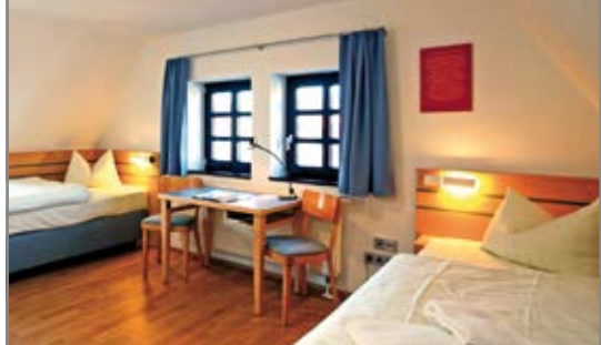
A guest room