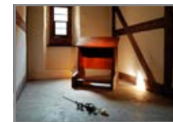
The Luther cell

The exhibition is an integral part of the monastery tour. It is also possible to visit it outside of a tour but only by prior arrangement.