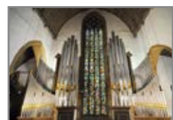
Walcker organ in the church