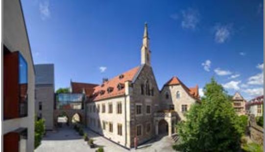
View of St Augustine's