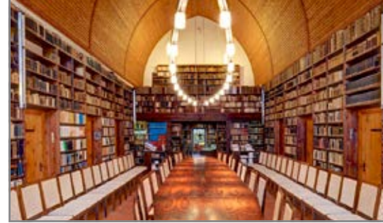
The historic library at St Augustine's

The Circle of Friends is a non-commercial organisation and is recognised as a charity by the German tax authorities.