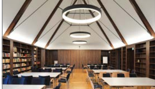
The Augustinus room in the 'House of Reconciliation'

St Augustine's or to give it its full name in German das Evangelische Augustinerkloster zu Erfurt , is a unique witness of the Lutheran tradition, of Protestant belief and of present day church life. The monastery in its completeness and cohesion is a rare example of medieval ecclesiastical architecture with three courtyards, monastery buildings and outbuildings. Construction work started in 1276.